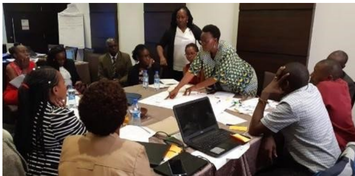
An ISAAA AfriCenter-led net-mapping exercise

The Net-Map tool successfully unlocks various stalemates/conflicts in systems, organisations and projects. The Netmapping process is particularly important because it helps in; defining how stakeholders are connected, identifying influencers of a decision or action, setting of priorities and strategies, defining coalitions/conflicting goals and picking out where efforts and/or resources are best invested. By gathering in-depth information about governance networks, goals of actors, and their power and influence, the net-map allows for empirical breakdown of complex multi-stakeholder governance, hence attainment of your milestone.