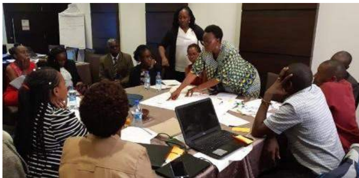
An ISAAA AfriCenter-led net-mapping exercise

The Net-Map tool successfully unlocks various stalemates/conflicts in systems, organisations and projects. The Netmapping process is particularly important because it helps in; defining how stakeholders are connected, identifying influencers of a decision or action, setting of priorities and strategies, defining coalitions/conflicting goals and picking out where efforts and/or resources are best invested. By gathering in-depth information about governance networks, goals of actors, and their power and influence, the net-map allows for empirical breakdown of complex multi-stakeholder governance, hence attainment of your milestone.