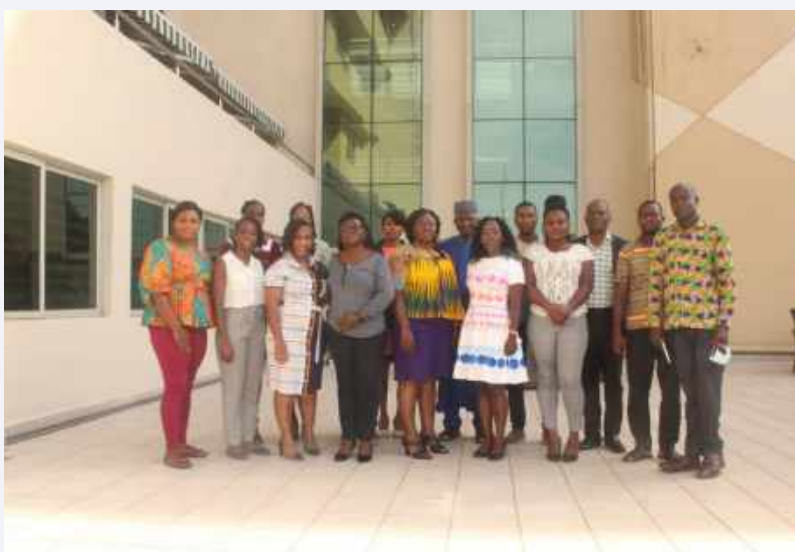
Ghanaian journalists pose for a photo at the ABBC2021

At the end of the sessions, a question was raised on how the voice and support of politicians can be secured. In response, the stakeholders were advised to engage and involve politicians right from start of biotechnology projects. It is important for such politicians to also understand the benefits in the technology for the country so that they don't become suspicious later in the process.