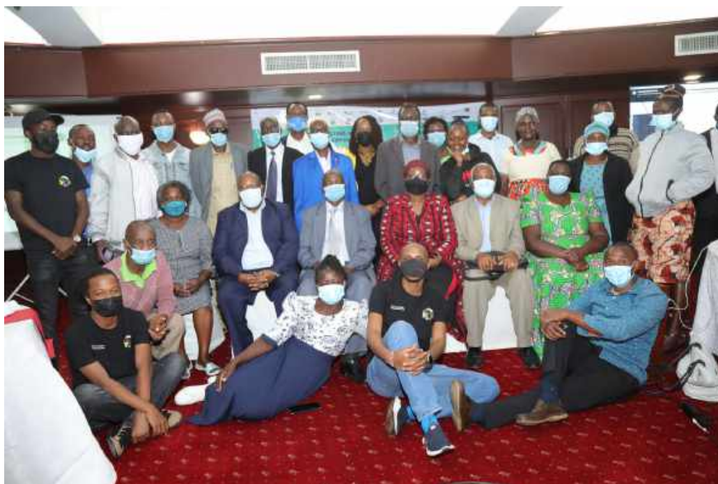
A group photo taken during the launch of the Africa Coalition on Communicating about Genome Editing

In summary, all the speakers embraced the idea of the coalition and promised to support and work with other coalition members.