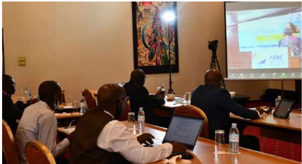
Ugandan participants follow the proceedings virtually