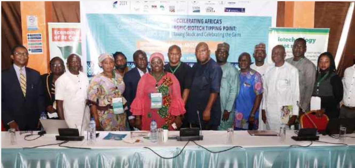
Delegates from Nigeria pose for a group photo in Abuja