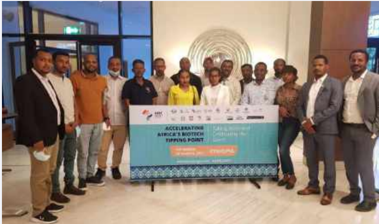
Ethiopian delegates during ABBC 2021