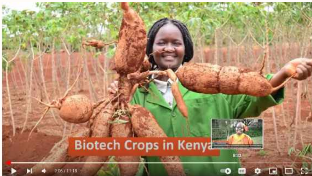
Screengrab of the Kenya biotech crops mini-documentary

During the closing session, a mini-documentary on Kenya's experiences with biotech crops was screened. The video captures voices and views of key stakeholders that have been involved in the journey to commercialization. Two key milestones were the 2019 milestone when the Kenyan Cabinet chaired by the President approved commercialization of Bt cotton. Further, 2021 National Biosafety Authority approval of GM cassava for National Performance Trials, the first country in the world to do so, was heralded as another milestone where key lessons shared could inspire countries aspiring to commercialize GM crops.