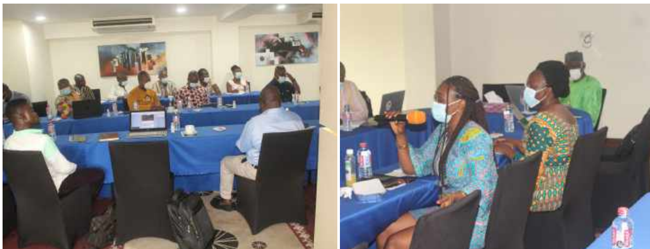
Delegates from Ghana participate in ABBC 2021 from Accra

The legislation also imposes a post-market environmental monitoring for each authorized GMO event, with yearly reporting. In addition, traceability and labelling obligations are imposed for any authorized GMO and products derived thereof in order to provide consumers with information and freedom of choice.