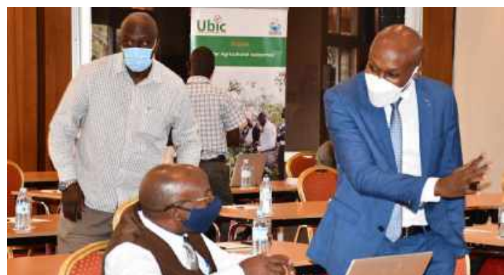
Ugandan delegates participate in ABBC 2021 from Kampala, Uganda