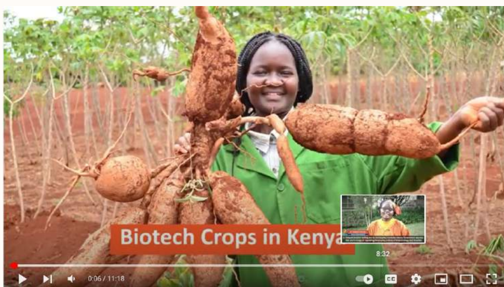
Screengrab of the Kenya biotech crops mini-documentary

During the closing session, a mini-documentary on Kenya's experiences with biotech crops was screened. The video captures voices and views of key stakeholders that have been involved in the journey to commercialization. Two key milestones were the 2019 milestone when the Kenyan Cabinet chaired by the President approved commercialization of Bt cotton. Further, 2021 National Biosafety Authority approval of GM cassava for National Performance Trials, the first country in the world to do so, was heralded as another milestone where key lessons shared could inspire countries aspiring to commercialize GM crops.