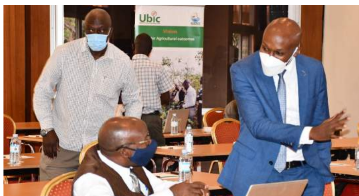
Ugandan delegates participate in ABBC 2021 from Kampala, Uganda