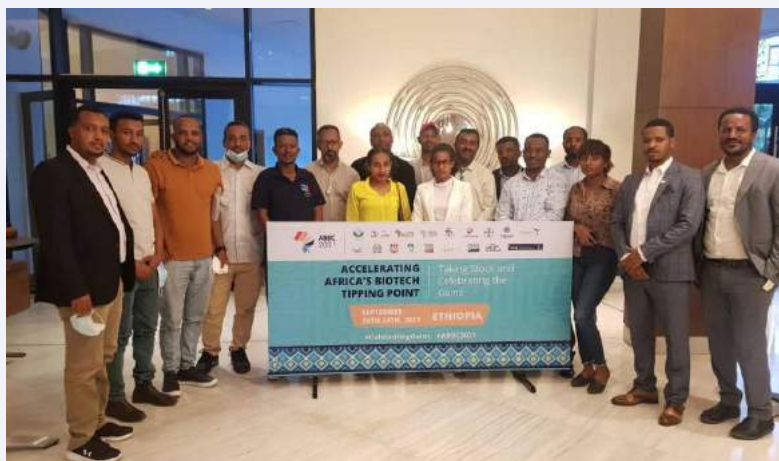
Ethiopian delegates during ABBC 2021