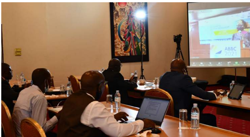
Ugandan participants follow the proceedings virtually