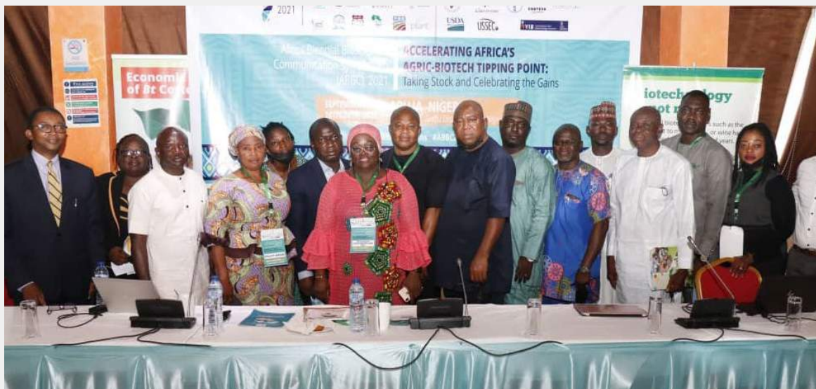
Delegates from Nigeria pose for a group photo in Abuja