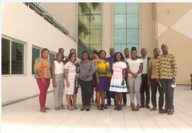
Ghanaian journalists pose for a photo at the ABBC2021

At the end of the sessions, a question was raised on how the voice and support of politicians can be secured. In response, the stakeholders were advised to engage and involve politicians right from start of biotechnology projects. It is important for such politicians to also understand the benefits in the technology for the country so that they don't become suspicious later in the process.