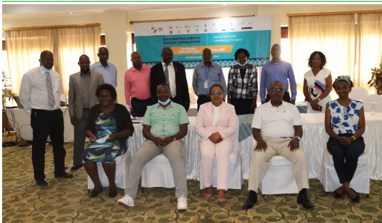
Delegates from Malawi pose for a group photo during ABBC 2021