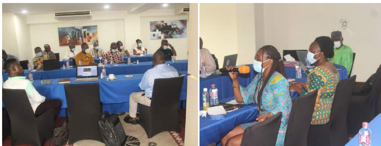
Delegates from Ghana participate in ABBC 2021 from Accra

The legislation also imposes a post-market environmental monitoring for each authorized GMO event, with yearly reporting. In addition, traceability and labelling obligations are imposed for any authorized GMO and products derived thereof in order to provide consumers with information and freedom of choice.