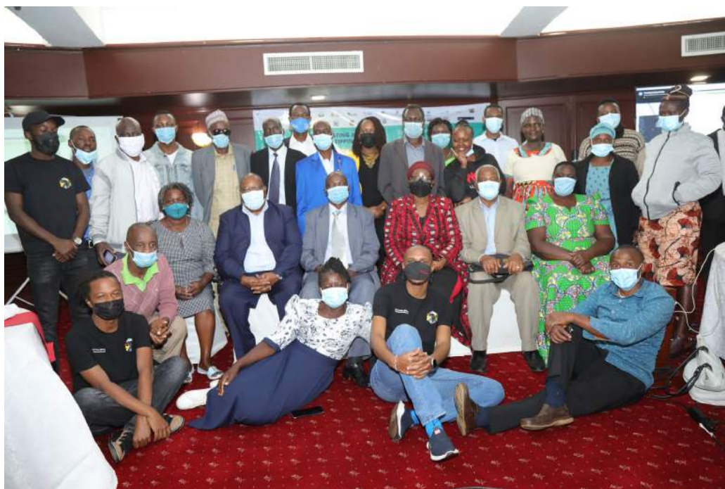
A group photo taken during the launch of the Africa Coalition on Communicating about Genome Editing

In summary, all the speakers embraced the idea of the coalition and promised to support and work with other coalition members.